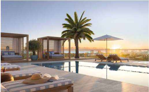
Another view of the rooftop deck Renderings by wearevisuals