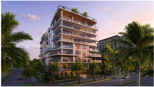
A rendering shows the design for Glass House Boca Raton, a nine-story luxury residential development.

The developer of the Glass House Boca Raton, the first modern glass building in downtown Boca Raton, closed on $9 million in early work development financing for the nine-story residential development.