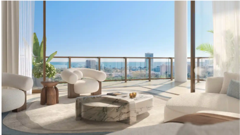
A rendering of what a living room in one of the 28 residences will look like. Renderings by wearevisuals