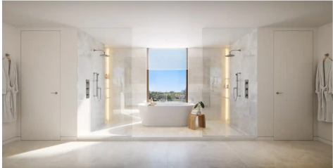
A rendering of a luxurious bathroom in one of the condo units. Renderings by wearevisuals