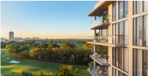
Glass House Boca Raton offers views of the ocean, Intracoastal Waterway and golf course.