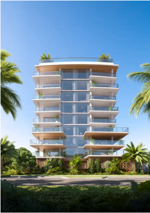
The nine-story building also boasts a rooftop deck with a pool. Renderings by wearevisuals

Douglas Elliman Development Marketing is the exclusive sales and marketing team for Glass House Boca Raton. Pricing ranges from $2.6 million to more than $7 million.